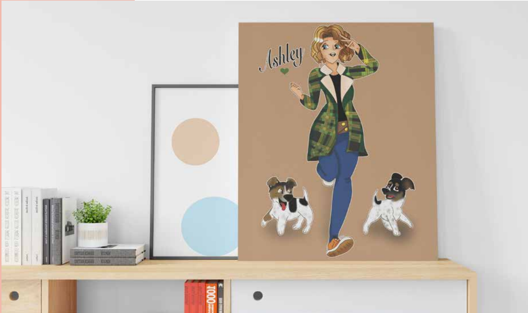
ILLUSTRATION Commission Drawing